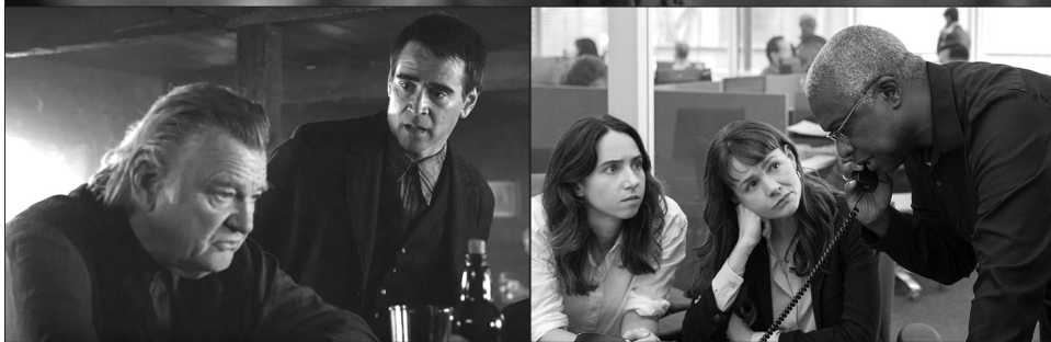
(cover) Cate Blanchett in Tár . (above, clockwise) Park Hae-il and Tang Wei in Decision to Leave ; Carey Mulligan, Zoe Kazan and Andre Braugher in She Said ; Brendan Gleeson and Colin Farrell in The Banshees of Inisherin .

We look forward to another Cinema Sundays Series. Kindly be advised that the increase in membership dues—from $120 to $140—results primarily from a change in film distributor policies. Distributors are no longer offering early, promotional screenings of films. The Club, therefore, must now pay film rental for each screening as well as other increased costs. Thank you for your understanding.